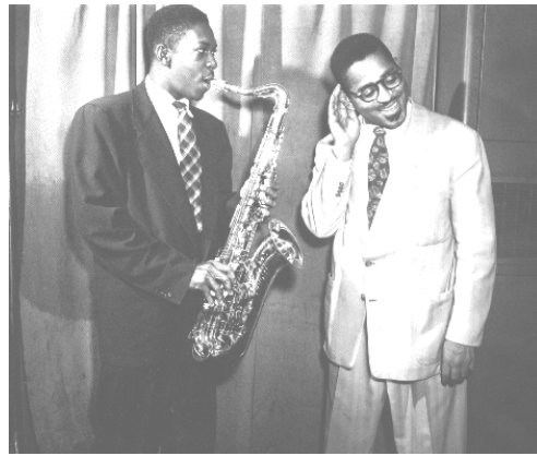
Coltrane and Gillespie

Released from the Navy in August 1946, Coltrane returned to Philadelphia. He was frequently on the road, by 1948 with Eddie 'Cleanhead' Vinson's band. In late 1949 he joined Dizzy Gillespie's big band on alto saxophone. The band recorded twice, in November 1949 and January 1950, but Coltrane doesn't solo. He stayed with Gillespie after the trumpeter downsized to a sextet in May 1950, switching to tenor saxophone.